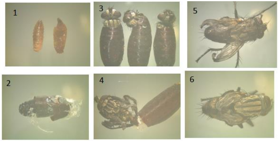
Fig 3: Morphological effects of the IGRs (Diflubenzuron, pyriproxyfen and Azadirachtin ) against S. dux by using feeding & dipping bioassay methods, the abnormalities ranged form :